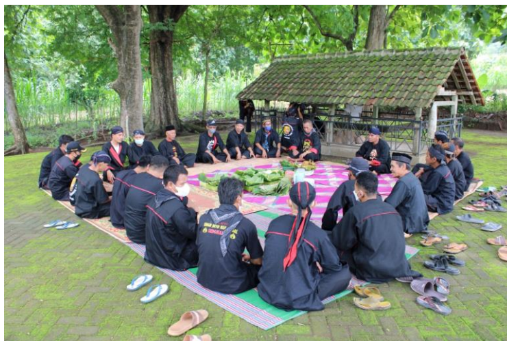
Picture 2. The Genduri Ceremony Preceding the Traditional Rain-Requesting Ceremony

"Before Reyog is played, there is a tradition of kenduri. Kenduri is held at the grave, first gathering then declaring their purpose, then the prayer is led by a religious figure/community figure, then kenduri." (Personal Communication, August 8, 2022)