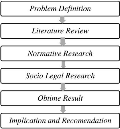
Figure 1: Research Methods

The final step involves formulating implications and recommendations. This step synthesises the research findings to propose potential reforms to the presidential threshold, ensuring better alignment with democratic principles as outlined in Indonesia's Constitution. It also recommends improving Indonesia's electoral processes to promote fairness, inclusivity, and better political representation for all parties, irrespective of their size or influence. The study addresses these critical issues and contributes to the ongoing discourse on electoral reform and enhancing democratic governance in Indonesia. (Djono et al., 2023).