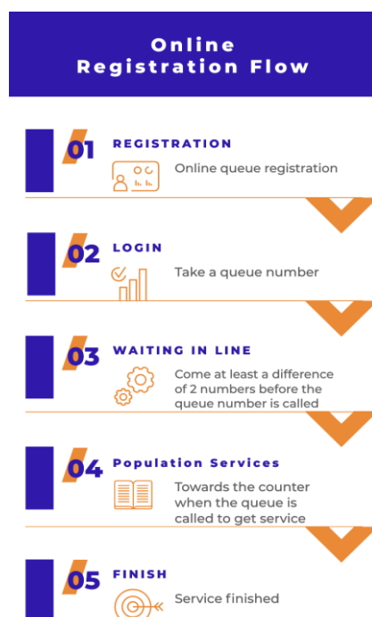
Figure 1. The flow of public services through online channels

Information: The first time the applicant registers via the gadget and enters the application that has been provided to get a queue number, the applicant is asked to come to the Population and Civil Registry Office at least two numbers apart before the queue number is called with the required files. The next step is to wait in the queue and then go to the counter according to the line to get service and finish.